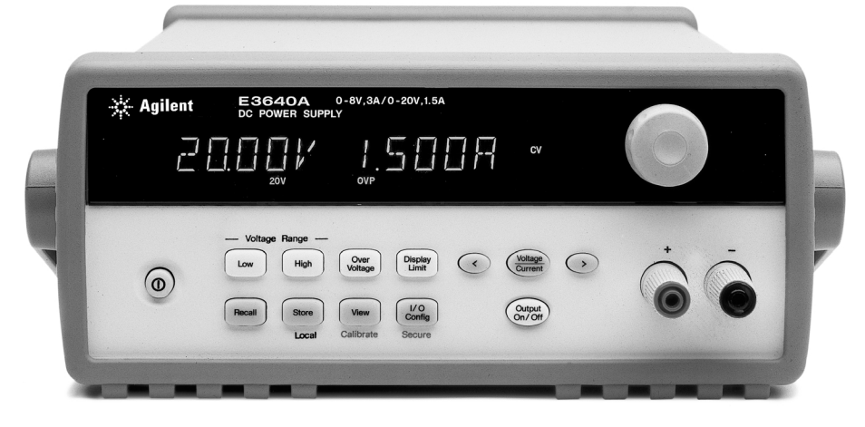
E3640A Dual Range Power Supply