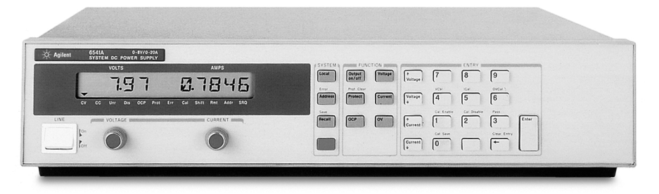
6600 Series High Performance System Power Supply