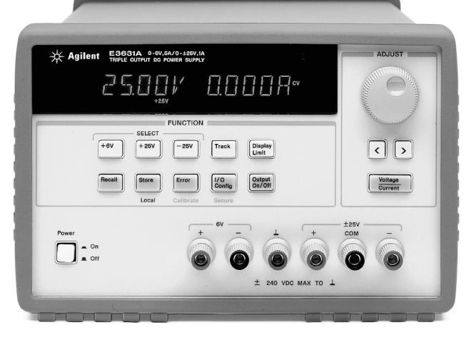
E3631A Triple Output Power Supply